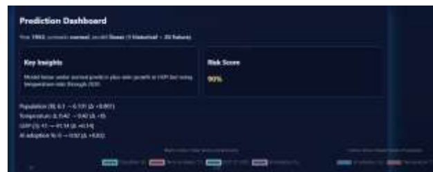
Fig 6. Prediction dashboard