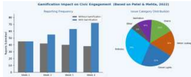
Figure2:Impact of Gamification

Points are awarded on trigger events: submitting a new report (10 pts), having a report validated (5 bonus pts), casting a validation vote (2 pts), and having a reported issue resolved (15 pts). Badge evaluation runs after each point event, checking predefined criteria such as First Reporter, Active Citizen (10 reports), Community Validator (10 votes), and Top Contributor (top 10 leaderboard). The public leaderboard ranks citizens by total points.