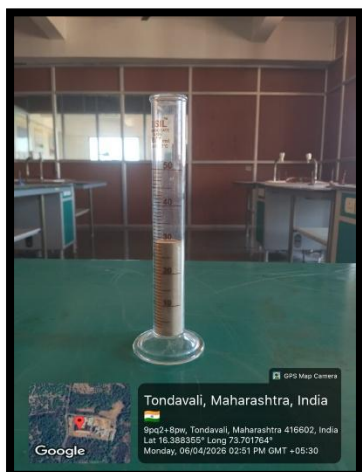
Fig No: 4.4 Bulk Density.