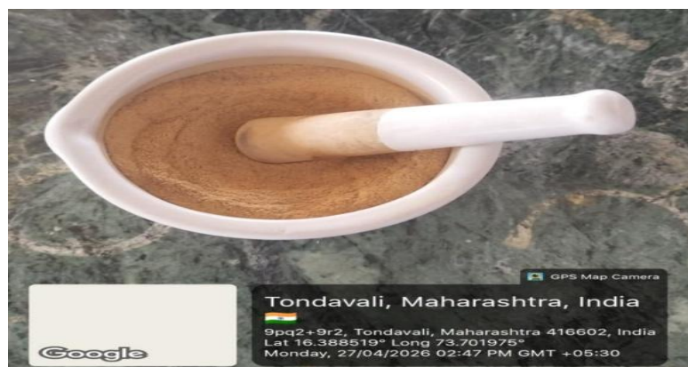
Fig No:4.1 Organoleptic Tests

The formulated face-pack powder showed a brownish-cream color, pleasant odour, and fine, smooth texture with no visible coarse or gritty particles. These organoleptic characteristics are desirable for cosmetic face packs, as they indicate a well-prepared, homogeneous blend suitable for facial application and are comparable to those reported for other herbal face-pack formulations.