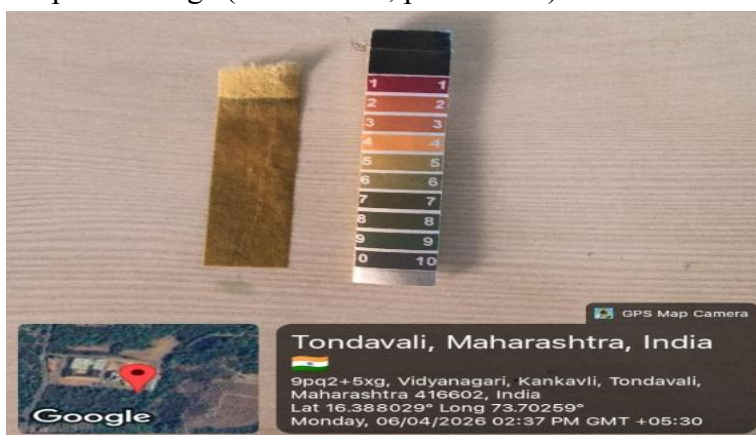
Fig No: 4.2 pH Test

The pH of the polyherbal face-pack powder reconstituted in distilled water was found to be approximately 6.5, which lies within the skin-compatible range (near neutral, pH 5.5–6.5).