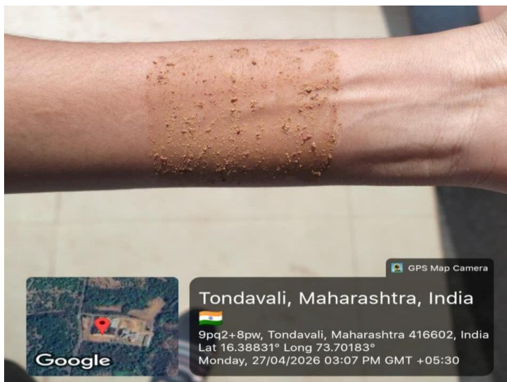
Fig No: 4.7 Skin Irritancy Test

On human skin application, the Maeua oblongifolia -based polyherbal face-pack paste did not produce any visible signs of irritation, erythema, or itching within the observation period.