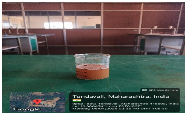
Fig No:4.3 Solubility Test

The formulated face pack was insoluble in water and alcohol, consistent with the nature of clay- and starch-rich herbal cosmetic powders.