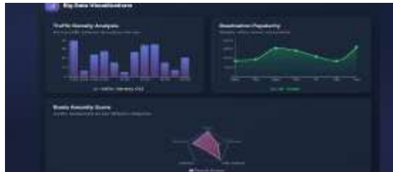
Figure 4.1.2 : Data Visualisation