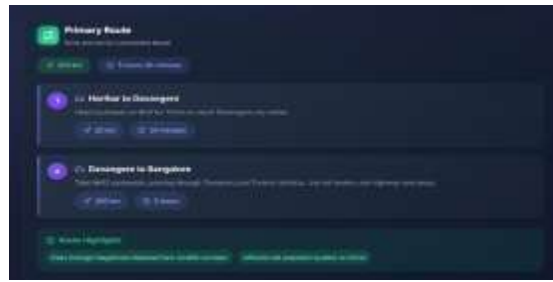
Figure 4.1.1 : Alternative Route