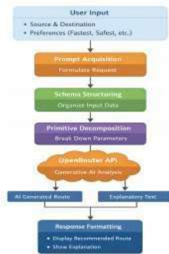
Figure 3.6.1 : Flowchart IV RESULTS