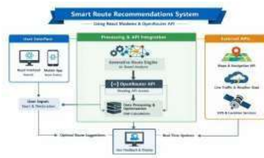
Figure 3.2.1 Architecture diagram

This structured representation ensures consistency in data handling and smooth communication between frontend, backend, and the OpenRouter API. By maintaining a clear schema, the system reduces ambiguity and enhances the quality of AI-generated recommendations.