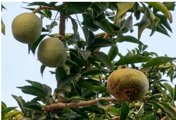
Fig.1.2 Aegle marmelos ( Bael fruit)

Aegle marmelos (L.) Correa, widely known as Bael or Bilva, is a deciduous tree native to the Indian subcontinent and Southeast Asia. Belonging to the Rutaceae family, it is characterized by its aromatic trifoliate leaves and hard-shelled fruit [11, 12]. In traditional medicine, A. marmelos holds a revered status. Ayurvedic texts classify it as Yakrit- uttejaka (liver stimulant), validating its centuries-old application in managing jaundice and digestive disorders [13, 14]. While the fruit pulp is typically utilized for gastrointestinal issues like dysentery, the leaves and bark are specifically noted for their ability to combat liver inflammation and metabolic dysfunction [12, 15]. This historical precedence provides a strong rationale for investigating its specific pharmacological mechanisms [11].