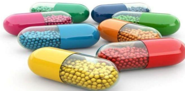
Fig. 1.3 capsule containing Aegle marmelos and Piperine

The preferred manufacturing method is Extrusion-Spheronization. This technique produces uniform, spherical pellets that flow easily and allow for high drug loading. The SR pellets (Bael) and IR granules (Piperine) are then filled into a single hard gelatin capsule, providing a convenient "once-daily" dosage form for the patient [30].