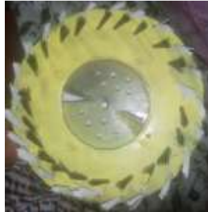
Figure 4.3: Brush

4.3,Cleaning Brush: The brush is attached to the flexible shaft and performs the actual cleaning operation. The rotating brush scrubs the tank surfaces and removes accumulated dirt and algae.