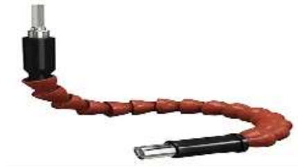
Fig 4.2 Flexible Shaf

4.3,Cleaning Brush: The brush is attached to the flexible shaft and performs the actual cleaning operation. The rotating brush scrubs the tank surfaces and removes accumulated dirt and algae.