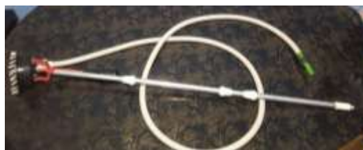
Fig 6.1 final project

Overall, the experimental results confirm that the proposed semi-automated water tank cleaning system improves cleaning efficiency and provides a practical solution for maintaining water hygiene.