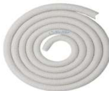
Fig 4.5 Hose

4.5,. Hose Pipe: The hose pipe is connected to the water pump and used to discharge contaminated water outside the tank.