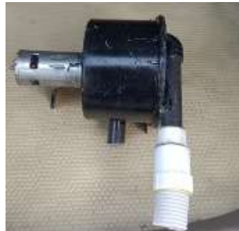
Figure 4.4: Water Pump Arrangement

4.4, Water Pump: A small 12V DC water pump is used to remove dirty water and sludge from the tank during cleaning. This helps maintain a cleaner environment inside the tank.