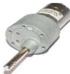
Fig4.1 12V DC Gear Motor

4.1, DC Gear Motor: 12V DC gear motor is used to rotate the cleaning brush. The gear system reduces the speed while increasing torque, allowing the brush to rotate effectively and remove dirt deposits.