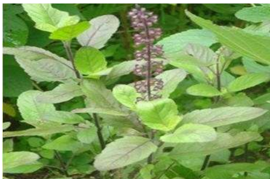
Fig 1 : Ocimum sanctum (Tulsi)

Tulsi is a plant practiced in Ayurveda which has thousands of curative properties since thousands of years. The plant is useful in all the parts including leaves and seeds. Tulsi has been identified as a source of natural energy and was also a source of physical power and immunity booster (7).