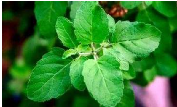
Fig 2 : Leaves of Ocimum sanctum