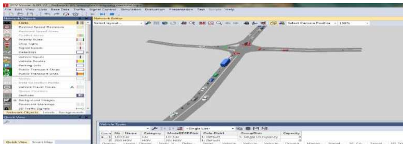
Fig :3.2 traffic volume data simulate with vissim softwre