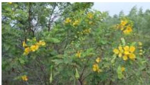
Figure 1: cassia auriculata

The plant is commonly known as Tanner's Cassia in English and Avaram senna in Tamil. Almost every part of the plant has medicinal value. Traditionally Avaram poo has been used for treating diabetes, urinary disorders, skin diseases and wounds. Women in Southern India have long used the flowers for maintaining ethnomedicinal relevance as a natural cosmetic agent. The plant have a phytochemical investigation that contains several bioactive constituents such as flavonoids, phenolic compounds, tannins, saponins, alkaloids and glycosides.