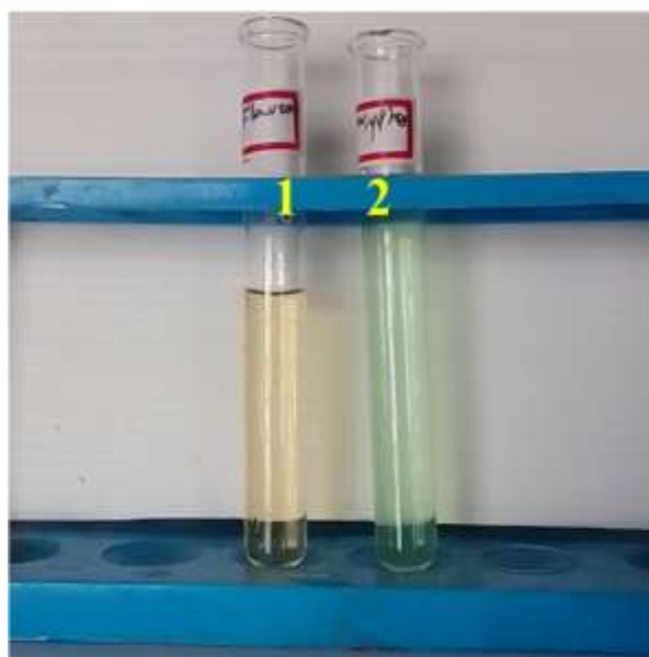
Figure 3: Quantitative analysis of TFC, TPC