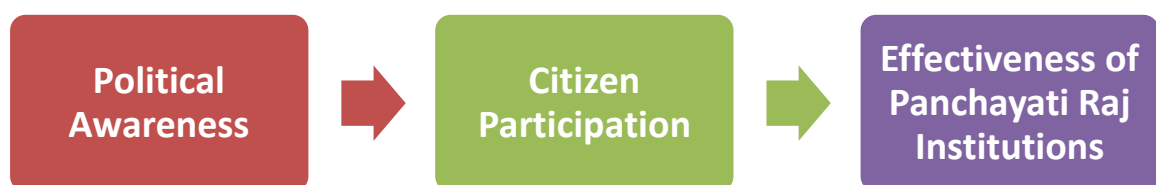
Figure 1.0 : Conceptual Model of the study

The conceptual framework of the study is developed to explain the relationship among the major variables considered in the research. Political awareness is treated as the independent variable, citizen participation as the mediating variable, and perceived effectiveness of Panchayati Raj Institutions as the dependent variable. The conceptual relationship among variables can be represented as follows: