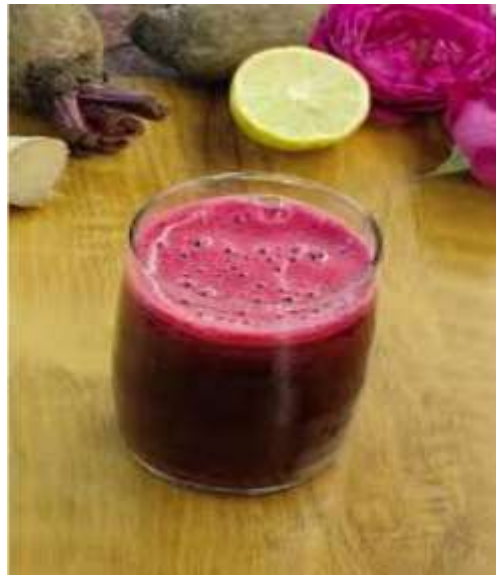
Fig 4: - Herbal refreshing syrup

Use a mortar pestle to crush the mint leaves, beetroot, and Tulsi leaves until they release their juices. Strain the crushed ingredients to extract their juices. You should have approximately 50ml of mint leaves juice, 5ml of beetroot juice, and 4ml of Tulsi leaves juice. In a large bowl, combine the mint leaves juice, beetroot juice, Tulsi leaves juice, and lemon juice. Mix well. Add 37ml of water to the mixture and stir well. Strain the mixture through a fine-mesh sieve to remove any pulp or sediment. then transfer it to a clean glass bottle. Store it in the refrigerator to preserve the syrup.