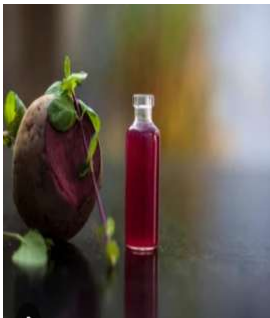
Fig 5:-Herbal refreshing syrup