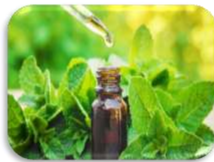
Fig 1:- Mint

MINT: - Mint help to alleviate feelings of stress, anxiety, depression and emotional balance. It calms effects on the nerves. It contain menthol which has cooling properties. It is rich in anti-oxidant that protect the brain. It refresh our mind and improve our mood. Contains menthol, which has a calming effect on the nervous system and is known to alleviate symptoms of anxiety and depression. Its fresh aroma and cooling properties provide an immediate, refreshing "mental reset".