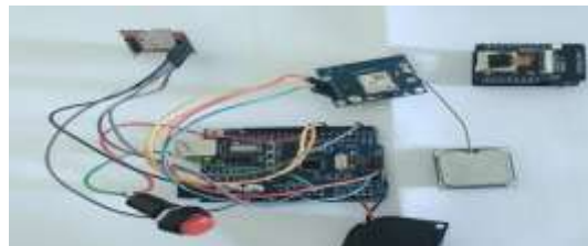
Fig. 4. Components used in the project

The hardware prototype is the physical layout of the "Intelligent Safety Pendant," which connects a number of electronic modules, together with a central microcontroller. This configuration is designed to execute the algorithm of the project (initialization of GPS, GSM, camera, and buzzer components). When the big red emergency button is pressed, the microcontroller initiates a chain of safety responses, including having the buzzer chirp getting attention, the GPS recording precise coordinates and the GSM controlling an instant SMS alert sending the live location of the person at the time to the already pre-programmed contacts. The mini camera captures live images/video for evidence. The goal is to offer a monitoring and emergency alert system of a real-time, comprehensive nature.