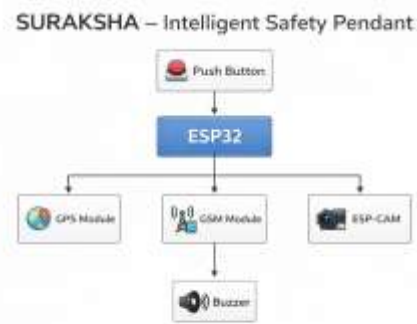
Fig. 2. Block Diagram of SURAKSHA – Intelligent Safety Pendant