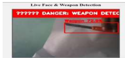
Fig. 7. Weapon Detection using AI

controller to provide an efficient personal safety solution. The takeaway points from this project are: