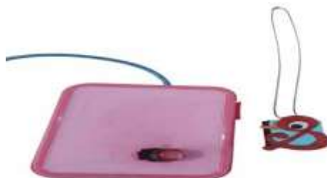
Fig. 5. Active Buzzer Module

1) Active Buzzer : The buzzer, this is the main local alert system. It is a little piezo-electric device which converts the signals of the Arduino Uno into a high-pitched yell of sound. It has two functions: first, it attracts immediate attention, so that it's a deterrent for any potential attackers; second, it serves as a local distress signal so that people in the vicinity of the wearer can help even before the SMS reaches far-away emergency contacts.