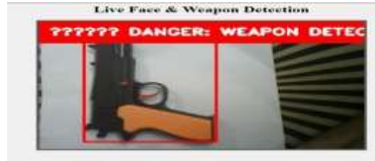
Fig. 6. Weapon Detection using AI

The SURAKSHA Intelligent Safety Pendant perfectly combines hardware sensors, communication modules and micro-