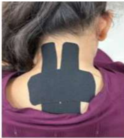
Figure1 kinesiотaping application

The tape used in this study is waterproof, porous, adhesive, 5 cm wide, and 0.5 mm thick. Patients in this group received Kinesio Taping while seated. The first layer was a Y-strip: the practitioner placed the un-split base directly over the spine in the mid-thoracic region and adhered it without tension. Subjects were instructed to tuck their chin to their chest while seated upright. The split ends of the Y-strip were stretched to 15-25% of the tape's resting length and applied along either side of the spine, covering the cervical muscles. This first strip extended from the T1-T2 thoracic region to the C1-C2 cervical region. The second layer consisted of an overlaying I-strip. (9)