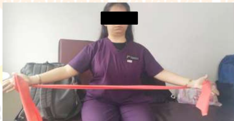
Figure 2 brueggers exercise

The participant was seated in a high sitting position with an elastic resistance band wrapped around each hand, leaving the palms open. They were instructed to abduct and extend the thumb and fingers, followed by wrist extension and forearm supination. The participant was also guided to perform scapular retraction with the chin tucked in, shoulder external rotation, elbow extension, and shoulder abduction and extension. The intervention began with a 10-second hold, gradually increasing to 30 seconds with a 2-second increment in each session. The rest period was 30 seconds, with 4 sets of 12 repetitions. (10)