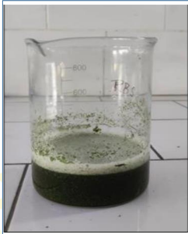
Figure. 1 Maceration of Hibiscus leaf