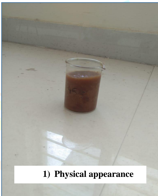
1) Physical appearance

Formula: Density of unknown liquid = Weight of unknown liquid/volume of unknown liquid = w/v.