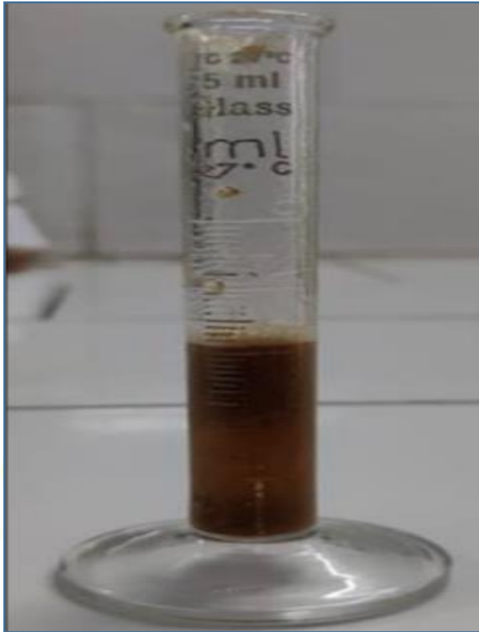
Figure 3 Foam Ability