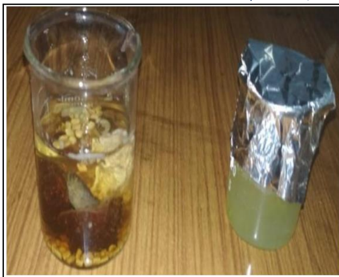
Figure 3. Extract of Hibiscus Leaf

Extraction was done by decoction Method –