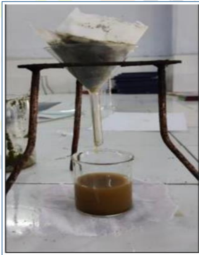
Figure 2. Filtration Process of Hibiscus Leaf