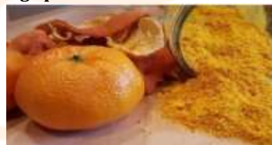
Fig. 5: Orange peels

Orange is a citrus fruit which contains different nutritional source like vitamin C. It also contains calcium, potassium and magnesium. It prevents the skin from free radical damage, skin hydration and oxidative stress. Also it has instant glow property, prevent acne, wrinkles and aging.