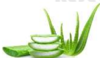
Fig. 3: Aloe vera.

The word aloe Vera means "aloe meaning shining bitter substance while "vera" means true. Aloe Vera contains vitamin A and C and it also shows anti-inflammatory properties. Aloe Vera belongs to