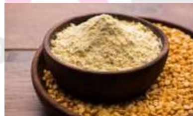
Fig. 6: Gram flour

Gram flour is good for acne-prone skin and can help to lighten any acne scars. It can also be applied all over the body to remove dark spots. It has been used as a base in preparation of herbal scrub.