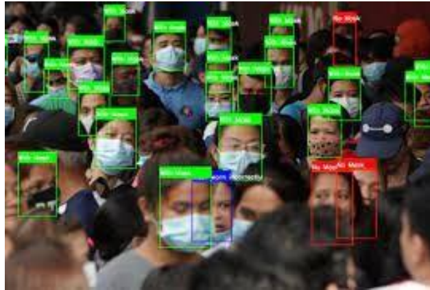
Figure 3 Result Output