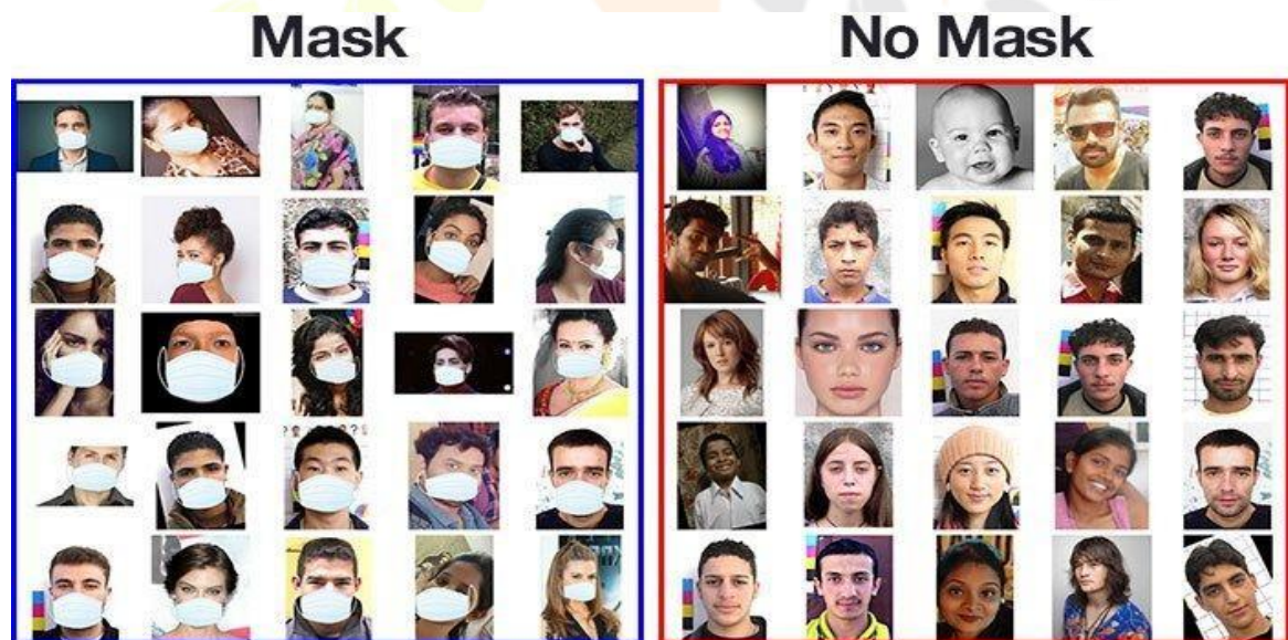
Figure 2 Images for training YOLO V5

This section will present the experiment results of the face mask detection using YOLO V5 in real-time application. A GUI (Graphical User Interface) will be created by using Tkinter. The Data preparation was first to load face images with and without mask (figure 2), then annotate bounding box of each vehicle in an image and save annotated images and labels. Initializing yolo network and generating training and testing datasets. We are using a publicly available dataset to train our model. Training in Load images and annotated labels, then Train yolo and save trained model. After training, Testing of the datasets can be implemented. Test the Load configuration and weight file of trained yolo and Input image to loaded model. Then Detect mask status in the image and shows the result (figure 3).