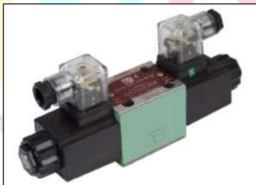
Fig.2.Direction Control Valve