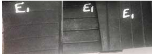
Fig.7. AVM 3

E1 is elastomer material as shown in fig below