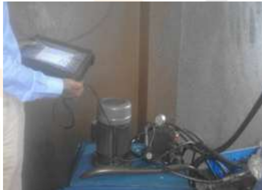
Fig.4. Vibrating system

As shown in figure, the hydraulic valve is mount on one platform, on same platform electric motor which sucks the hydraulic oil is mounting. Therefore the vibration on hydraulic valve is due to two reasons first is due to vibration of electric motor it means when electric motor run or doing its operation vibration is produce due to this vibration hydraulic valve also vibrates. Second is due to vibration of hydraulic valve itself it means that when valve is in working due to change in pressure of flow of hydraulic fluid vibration is occur in hydraulic valve. Due to both vibration hydraulic valve is vibrate.