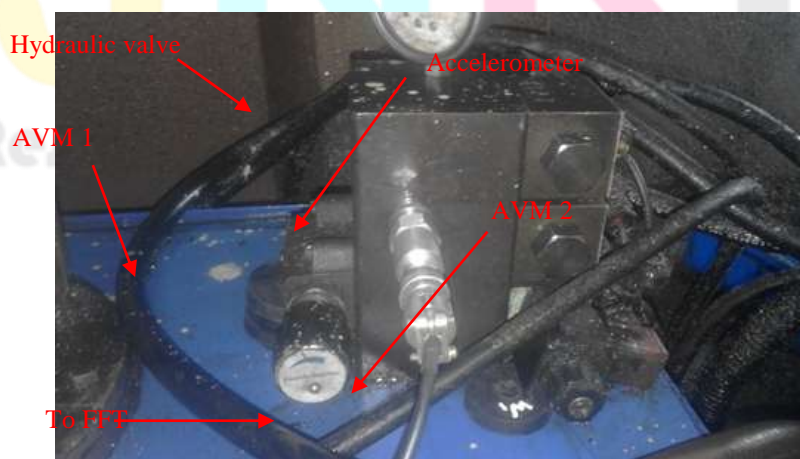
Fig.9. Experimental Setup (Vibrating system with Accelerometer and AVM)

Direction control HV is regulated pressure and the direction of Hydraulic Fluid which is supply to the hobbing machine. This hydraulic fluid is use during the vertical broaching operation on hobbing machine, so pressure of HF is change during changing the condition of broaching operation. Mainly three operating condition was consider during the vertical broaching process. First is when job is mount on machine and the broaching tool just touch the job, it means just start the operation or first teeth of broaching tool are engaged with job. Second condition is during the broaching operation, means when middle part of vertical broaching is done. Third condition is when the operation is just ended or the last teeth of broaching tool are engaged with job. Therefore during these three conditions due to change in pressure of HF, so vibrational force is change and amplitude of vibration on HV also change.