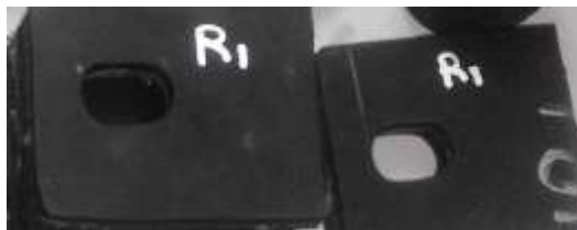
Fig. 5. AVM 1

We are choosing four anti-vibrating materials which have different mechanical properties like stiffness and damping coefficient. R1 is the Re-inforced rubber with cotton material as shown in fig below