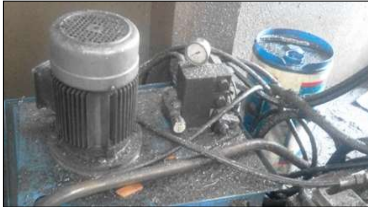
Fig.1. Vibrating System

HV is a vibrating system which vibrations should be reduces. The hydraulic valve is mount on one platform, on same platform electric motor which sucks the hydraulic oil is mounting. Therefore the vibration on hydraulic valve is due to two reasons first is due to vibration of electric motor it means when electric motor run or doing its operation vibration is produce due to this vibration hydraulic valve also vibrates. Second is due to vibration of hydraulic valve itself it means that when valve is in working due to change in pressure of flow of hydraulic fluid vibration is occur in hydraulic valve. Due to both vibration hydraulic valve is vibrate.