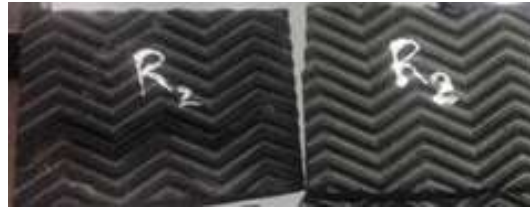
Fig.6. AVM 2

R2 is the Nitril base rubber material as shown in fig below