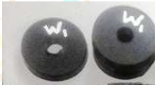
Fig.8. AVM 4

These are the different AVM of different properties and different size. It means that out of four AVM three are have same rectangular shape and same size (7x6cm) but washer has cylindrical shape.