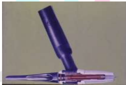
Fig. 2.4 Selection of typical electrode holder (water cooled)

TIG welding torches hold the tungsten electrode, which conducts welding current to the arc, and provide a means for conveying shielding gas to the arc zone. Torches are rated in accordance with the maximum welding current that can be used without overheating. A range of electrode sizes and different types and sizes of nozzles, can normally be used in the same torch. The heat generally in the torch during welding is removed either by gas cooling or water cooling. Accordingly, the torches are called as Gas Cooled or Water Cooled Torch. Gas cooled torches provide cooling by the flow of the relatively cool shielding gas through the torch. Gas cooled torches are generally used for a maximum welding current of about 200 amperes. However, torches are available up to 300 A with gas cooling. The torches are heavy but are useful in site welding where there is no water availability.