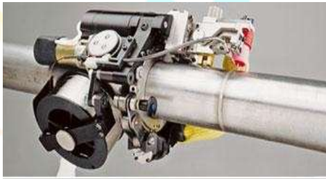
Fig. 2.1 Orbital Pipe Welding