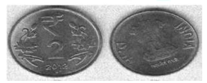
Figure 3: Image with Poisson noise

Poisson Noise (Photon Noise):- Poisson or shot photon noise is the noise that can cause, when number of photons sensed by the sensor is not sufficient to provide detectable statistical information [4]. This noise has root mean square value proportional to square root intensity of the image. Different pixels are suffered by independent noise values. At practical grounds the photon noise and other sensor based noise corrupt the signal at different proportions [3].