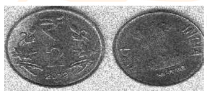
Figure 4: Image with speckle noise

Speckle Noise:- This noise is originated because of coherent processing of back scattered signals from multiple distributed points. In conventional radar system this type of noise is noticed when the returned signal from the object having size less than or equal to a single image processing unit, shows sudden fluctuations.